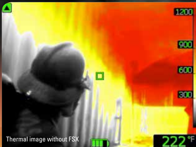
Thermal image without FSX