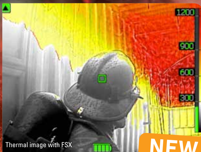
Thermal image with FSX